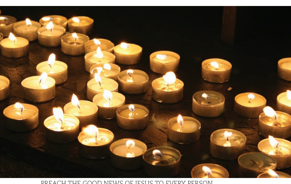
PREACH THE GOOD NEWS OF JESUS TO EVERY PERSON